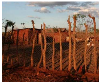
This living wall's fence posts ( Commiphora sp. ) will soon re-sprout.

In southern Tanzania, 15 village game scouts completed ranger training in July. And, the six villages we are working with in the region created a joint community-based organization to govern