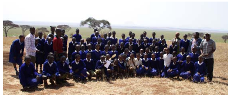
155 students, teachers and village officials visited the park on August 30th and 31st.

Participants were able to see a lion hunting oryx, cheetah hunting impala, and a leopard resting on a tree branch. They also saw many other wild animals, birds and the amazing baobab trees found in Tarangire National Park. It was a "lifetime adventure" for all! 🐾